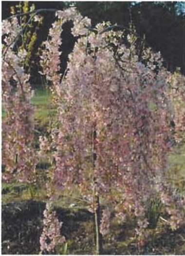
Weeping Louisa crabapple