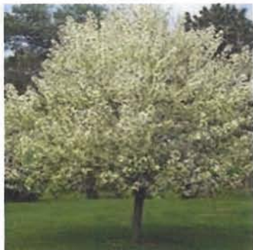
Spring Snow (fruitless)crabapple

All over Bend the flowering crabapples are bursting with beautiful blossoms. A wonderful gift that will keep on giving!